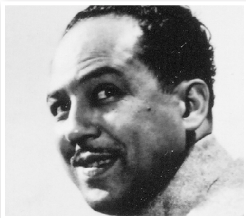
Estate of Langston Hughes '29 $11,127.04