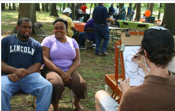
2010 Annual Alumni Family Outing